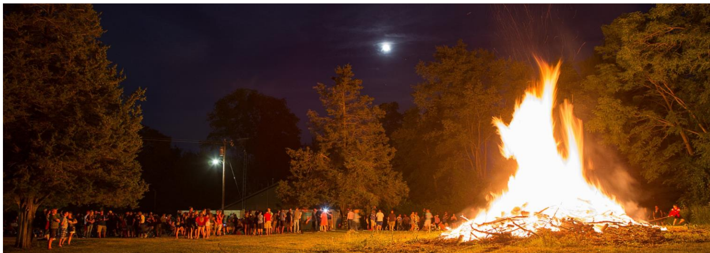
The Kokko at Juhannus, June 18, 2016.