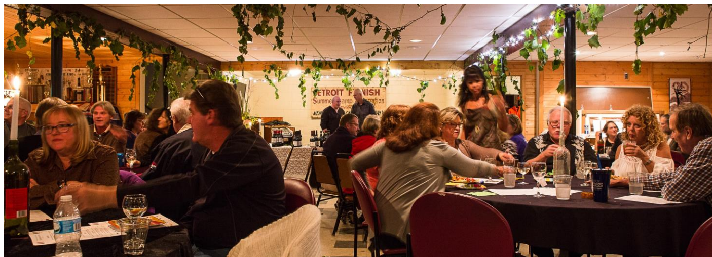
Scene from Ninth Annual Wine Tasting event at Clubroom in October.